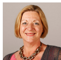
Linda Fabiani Scottish National Party