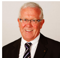
Convener Bruce Crawford Scottish National Party