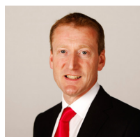
Tavish Scott Scottish Liberal Democrats