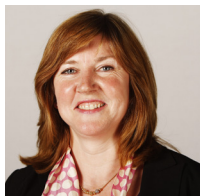
Alison Johnstone Scottish Green Party