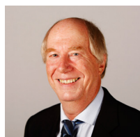
Malcolm Chisholm Scottish Labour