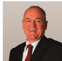
Deputy Convener Duncan McNeil Scottish Labour