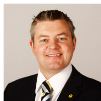
Stuart McMillan Scottish National Party